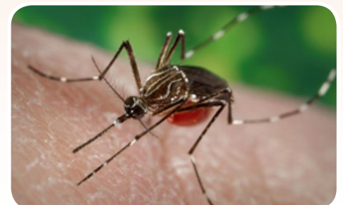
An adult mosquito bites a person.