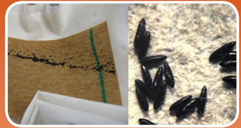
Eggs look like black dirt.