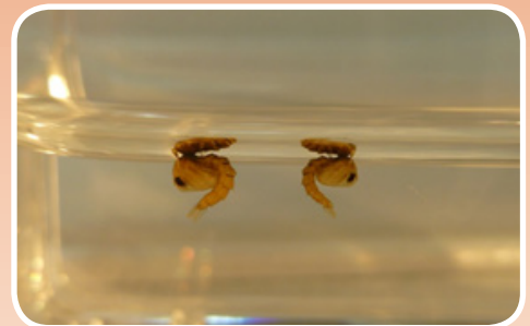
Pupae in the water.