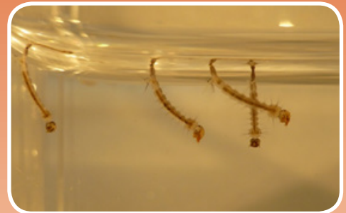
Larvae in the water.