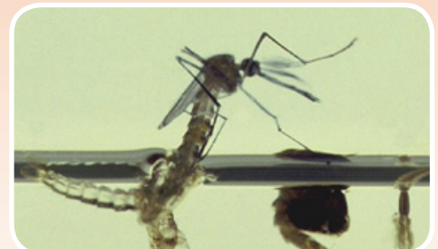
An adult mosquito emerges from a pupae.